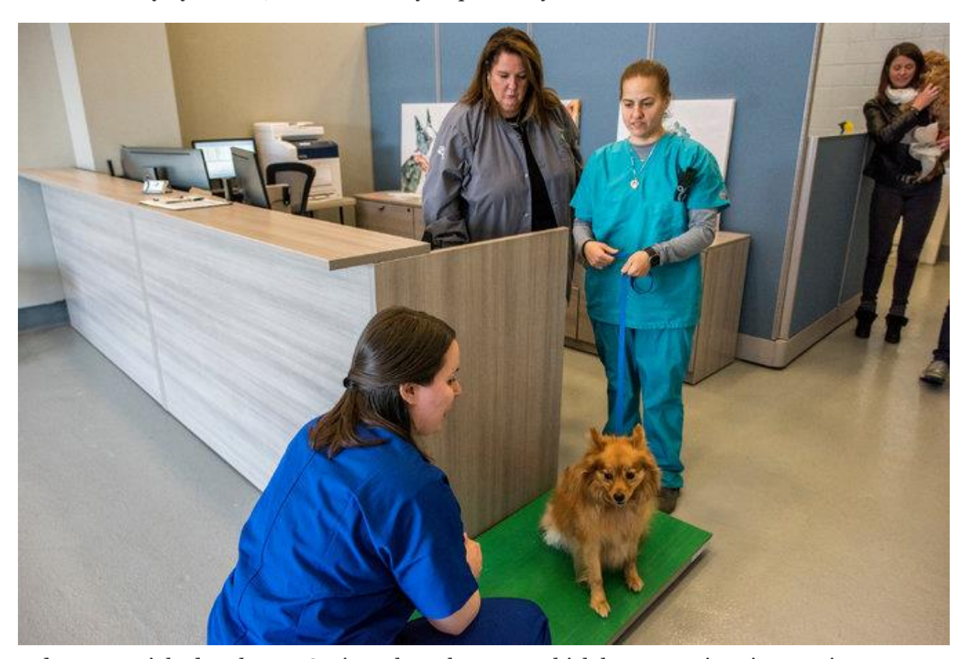
A dog was weighed at the Pet Oasis at the Ark center, which houses various in-transit animals.

Pet owners willing to part with some extra cash have the option of using the Ark's <u>Pet Oasis</u>, which opened in January and assists in-transit animals left by their owners before they fly, or by pet shippers or airlines. Ark vehicles can transport animals from jets to the 4,000-square-foot Pet Oasis. Staff members groom, feed, water, walk and play with the animals. Rates, which vary by service, are available by request only.