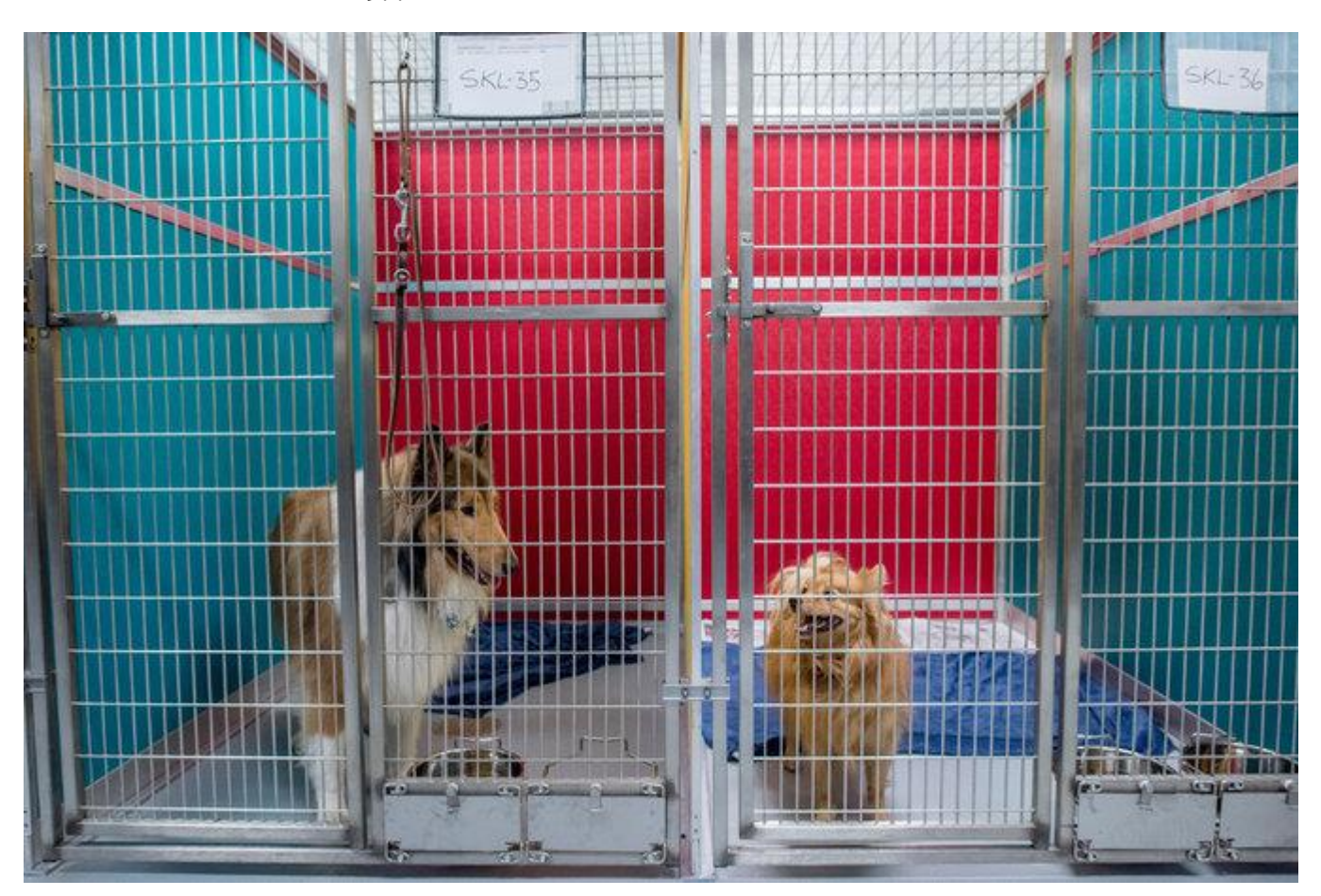
Dogs in the kennel at the Pet Oasis at the Ark, which opened in January.

Outside the United States, Lufthansa has operated a 43,000-square-foot "Animal Lounge" at the airline's hub airport in Frankfurt since 2008. Far older is the Heathrow Animal Reception Center, operated by the City of London since 1977.